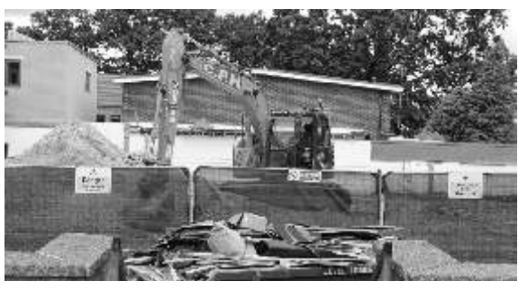
The building surrenders without much of a fight – perhaps sensing its coming upgrade?

The architect's impression of the external view of the new Mayes Building