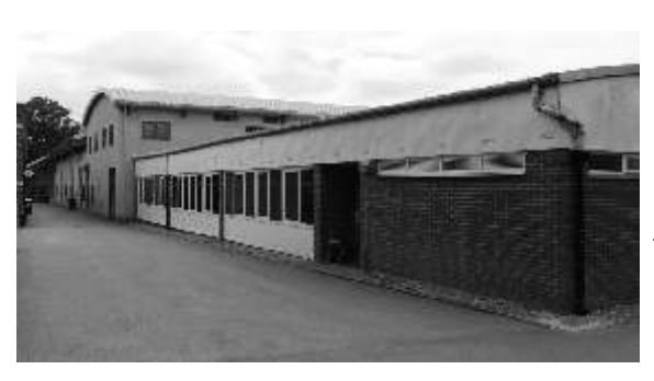
As it looked recently – still retaining dowdy elements of its past but now joined to newer buildings

Just to keep you updated on the goings-on behind the main School building and the transformation of the old building